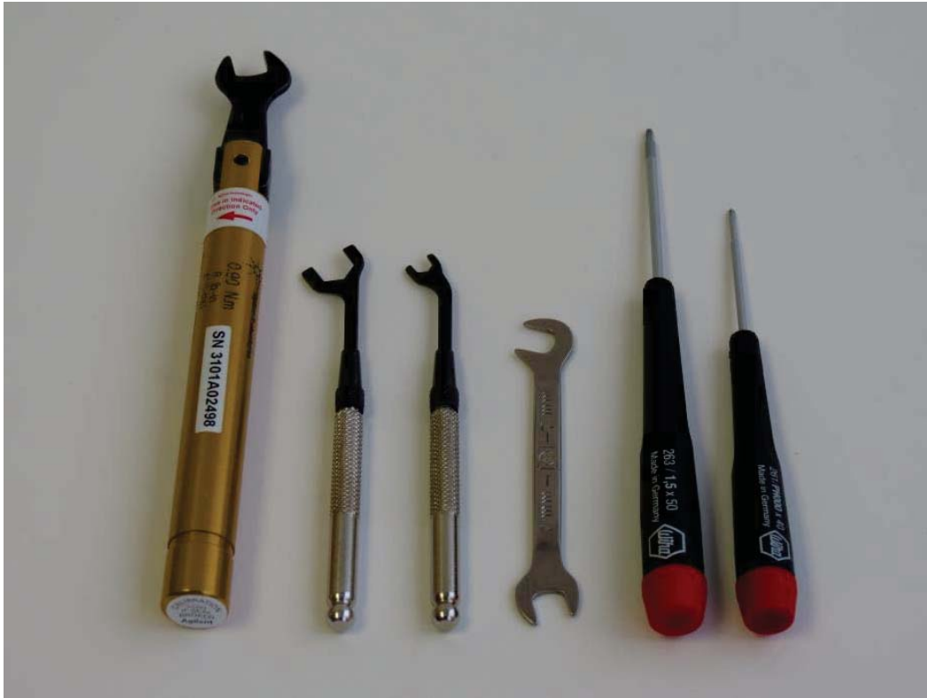
Figure 10: Recommended Permissible Hardware Instruments